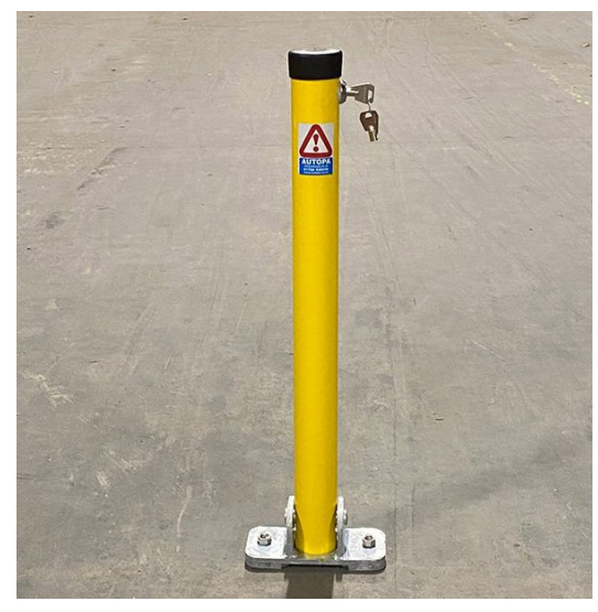
Ideal for securing car parking spaces or for anti-theft purposes